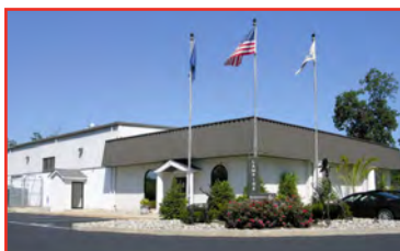
Biotech Research & Resource Center Pipersville, PA

To discuss any of our Contract Manufacturing services contact our Operations Staff at 215-766-4901, or to inquire about any other of Lampire's offerings, please call us at 215-795-2838 or email lampire@lampire.com.